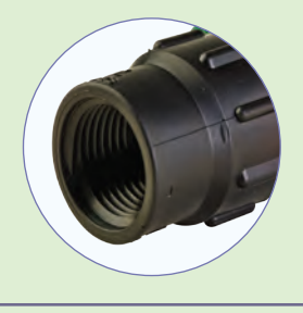
Threaded Inet Connection Threaded inlet connection provided for connectivity with system

Special Inlet Filter Supplied with special filter to prevent blockage by sand/ slit particles which ensures troubl free performance